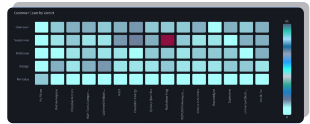
Low-code dashboard widgets visualize MSSP client cases by severity level.

Turbine webhooks and remote agents ingest, de-duplicates, correlate and enrich data from broad and hard to reach telemetry sources.